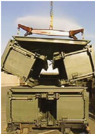
Top: A Double Storey MGB bridging the gap.

WFEL has come a long way since 1915 and our continued commitment to engineering excellence and innovation has kept us at the forefront of tactical military bridging design and manufacture.