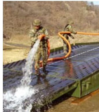
Top: A WFEL team trains troops in South Korea.

With our products continually updated to incorporate advances in design and user feedback, customers are immediately notified of product upgrades.